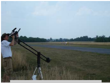
Higher Planes Productions was out shooting some footage