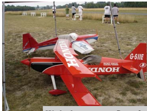
We had some guest flyers from Jacksonville and Roanoke Rapids. This is a couple of their giant birds!!