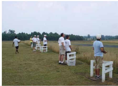
This is what the flight line was like all day!!!