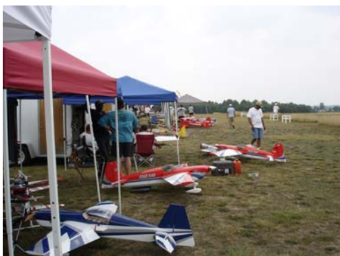
Man, we had a great turnout!!!