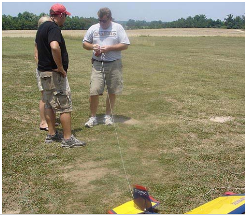
The guys prepare their planes to haul trash!!