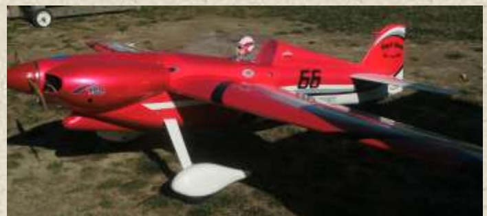
Racing at RD-RC