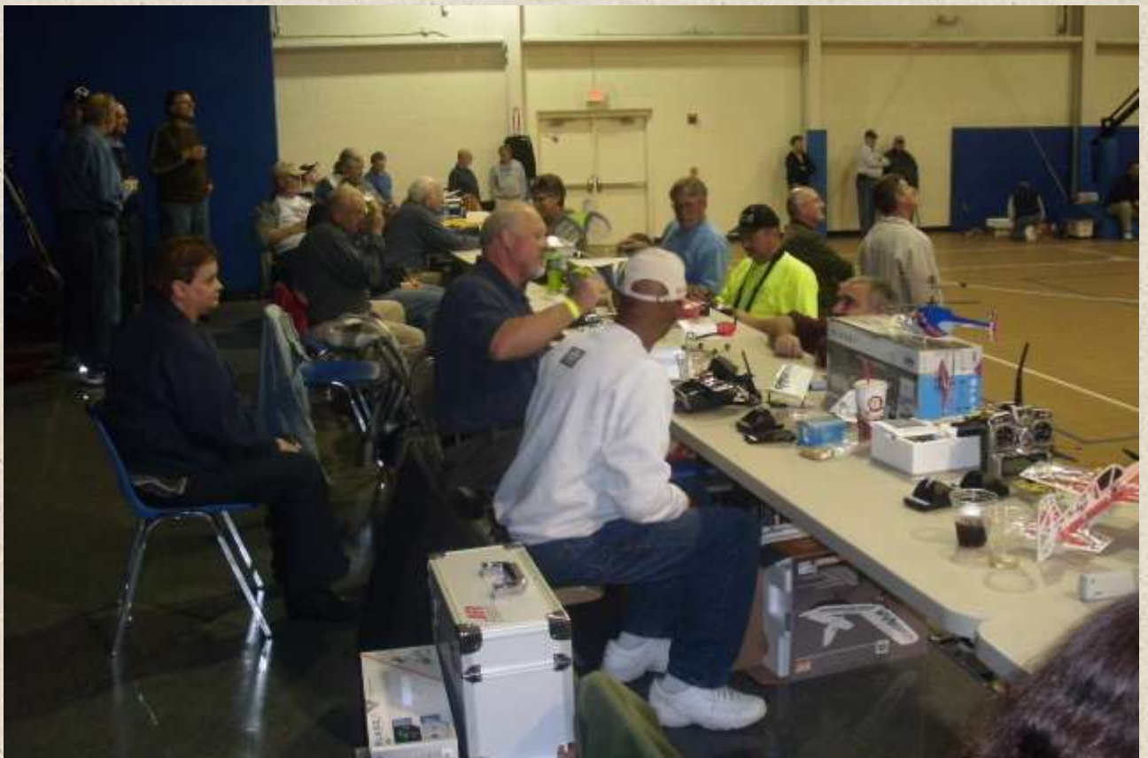
"Behind the scene" action at the indoor fly-in