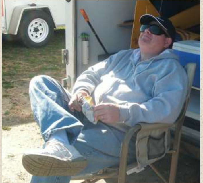
One day John got a bit too comfortable