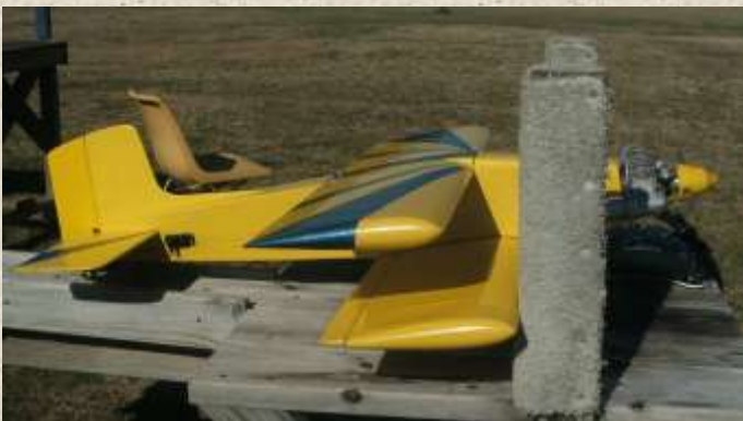
This is what it's all about