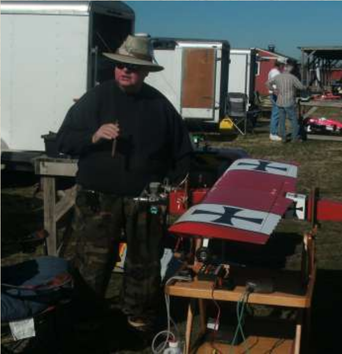
Why do you think they call him the “Field Marshall”?