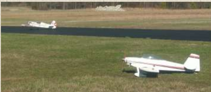
A clear example of Traffic Control being required here