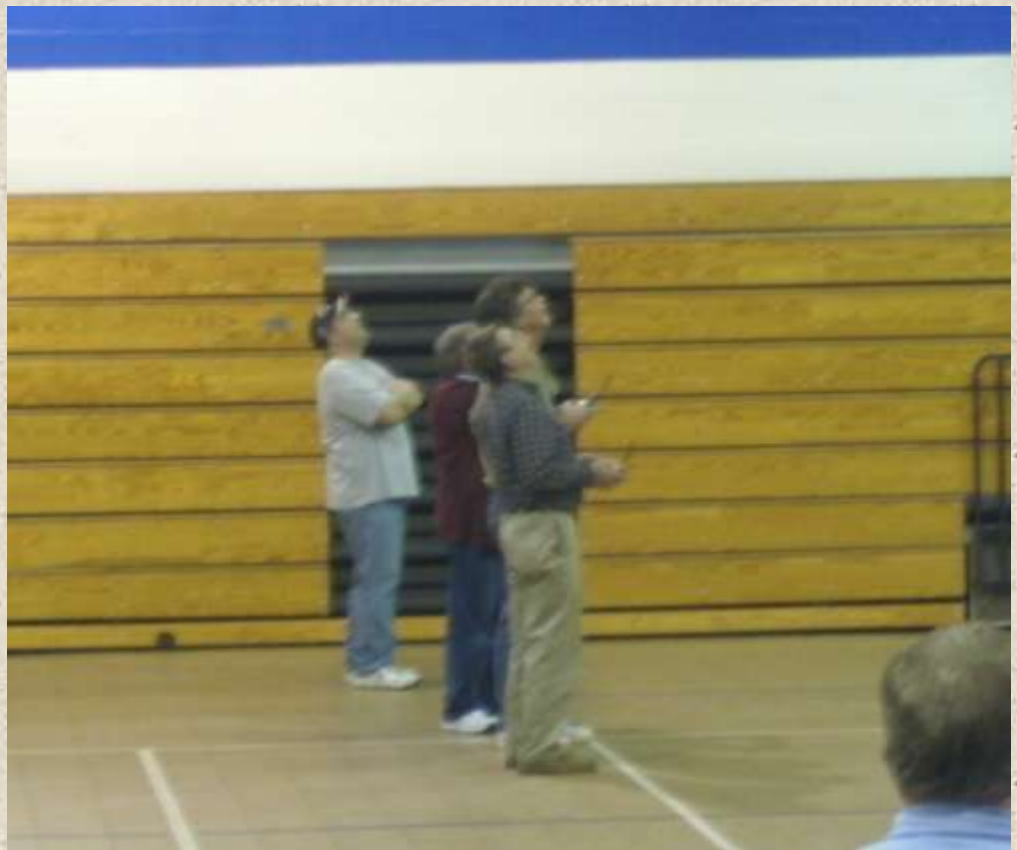
...and the folks that tried to get it back down.