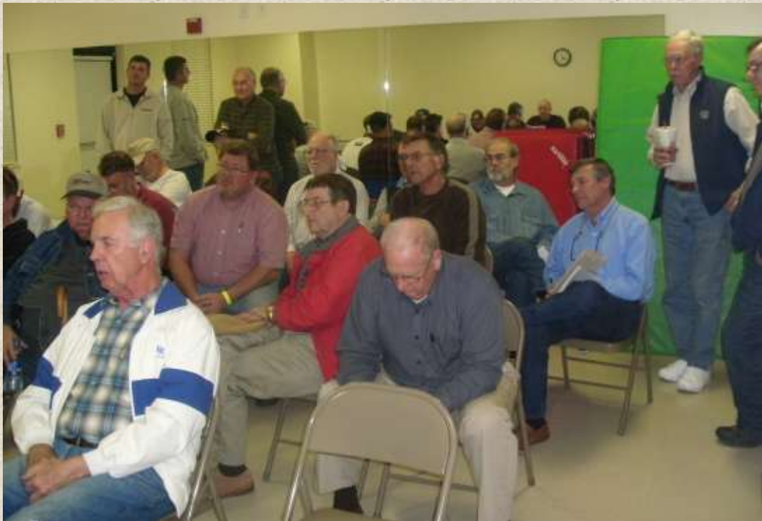
...to a house full of of RD-RC members