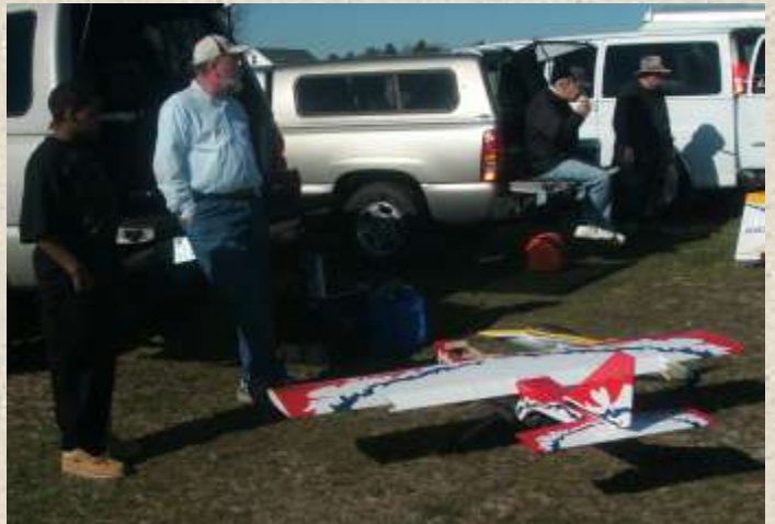
Ever wonder how rumors get started?