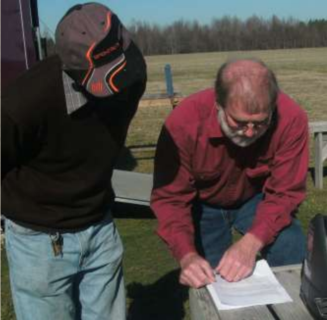
This is already getting too complex for me