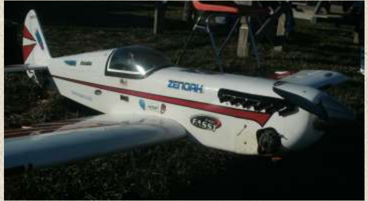
Manny's "Fast-Fly-By Machine"