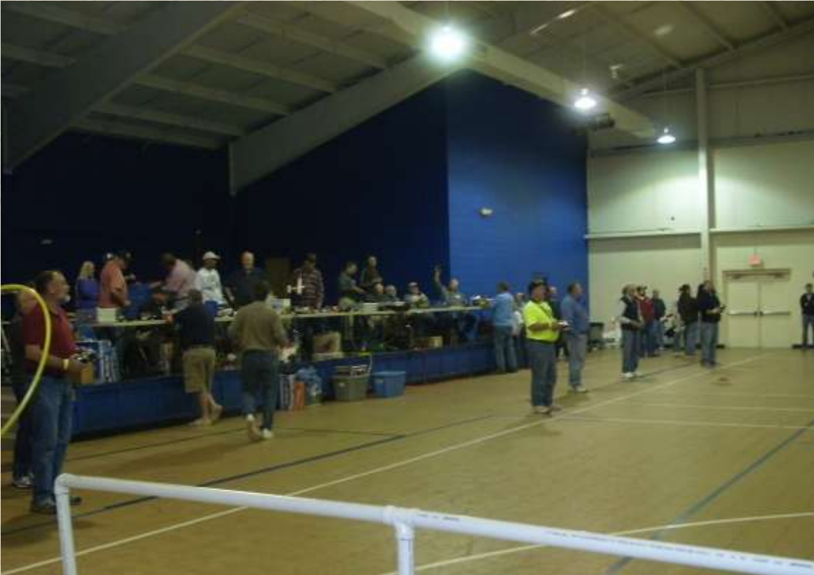
Indoor fly-in had plenty of pilots with plenty of indoor flying space