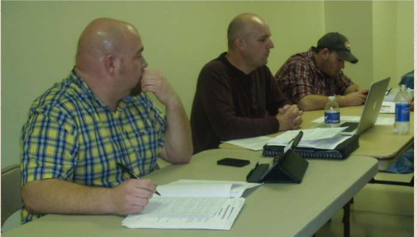
Our newest leaders performing their honorable duties...