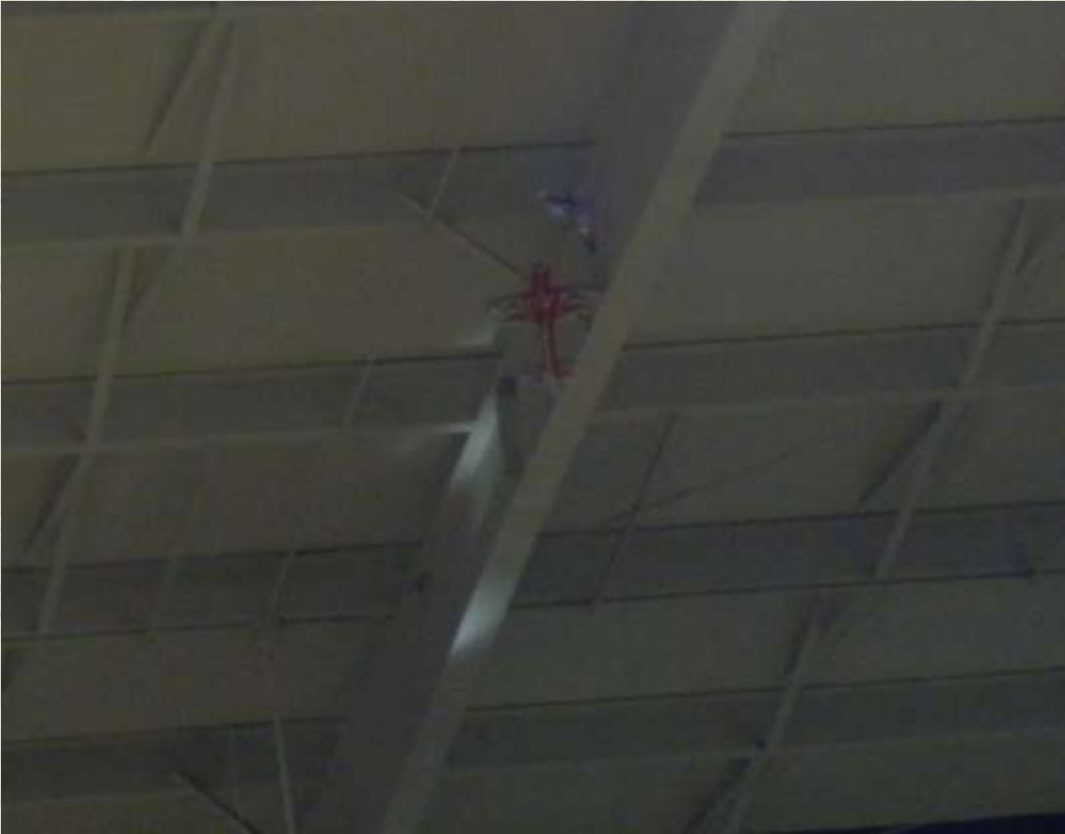
The “stuck” aircraft at the indoor fly-in...