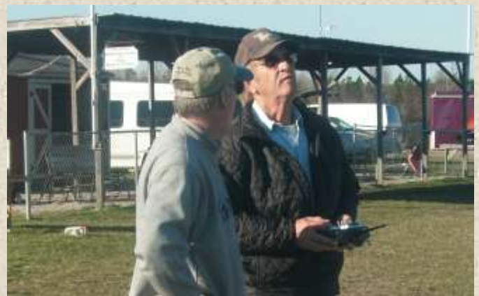
This is back-seat-driving