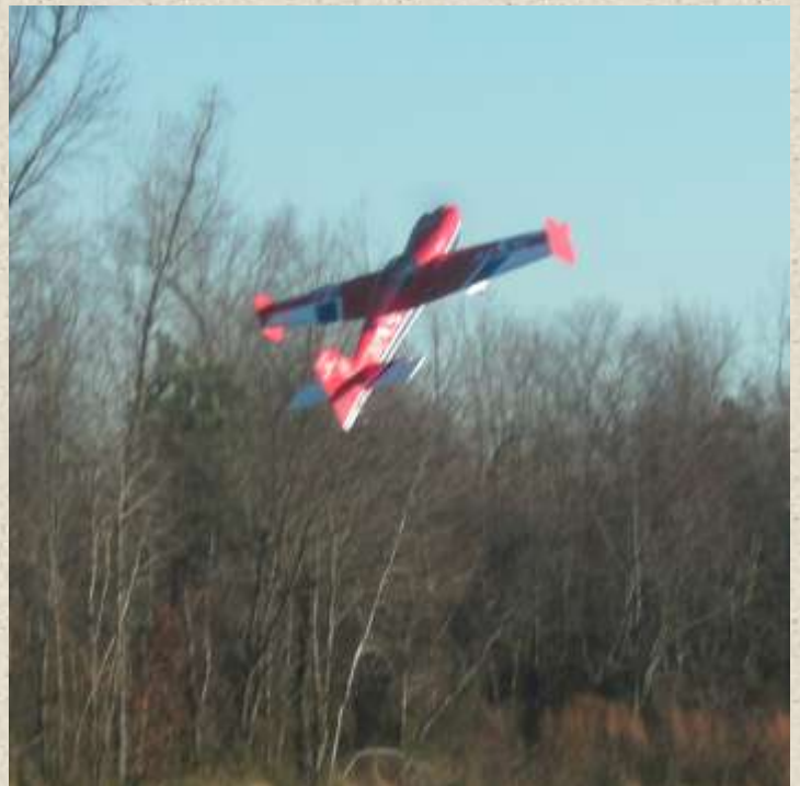
"Pop-up" — The start of a good time