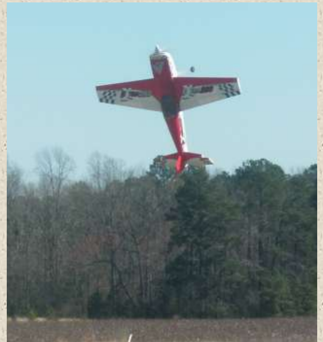
...and here is how you usually see Danny flying it