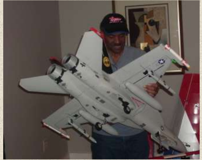
“Show and Tell” at the last RD-RC Monthly Meeting