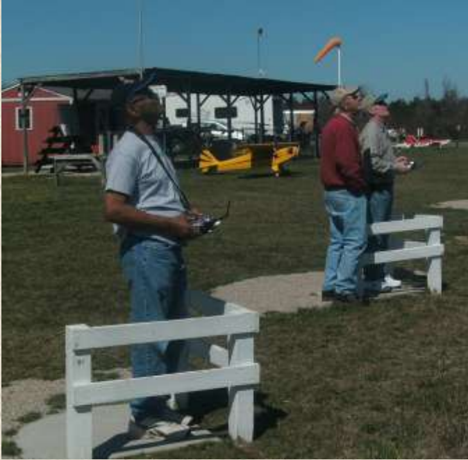
RD-RC Pilots demonstrate the proper use of the Flight Stations