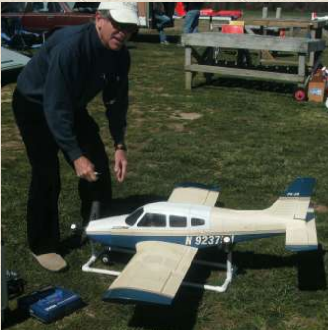
One of Pat's Winter Projects makes an appearance