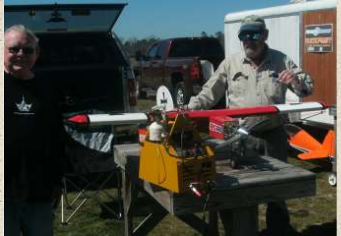
This team converts glow engines to run on gasoline