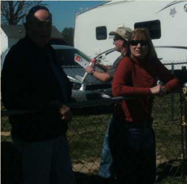
RD-RC virtually always draws a crowd of Spectators