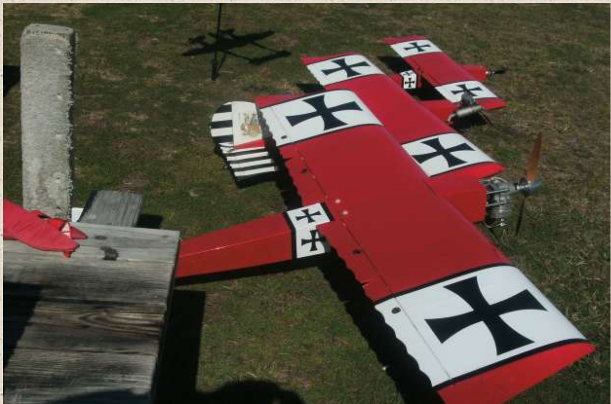
One of these is the Mother of all F - - kers