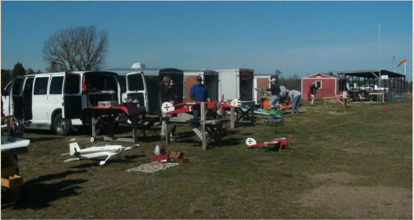
Typical day at RD-RC