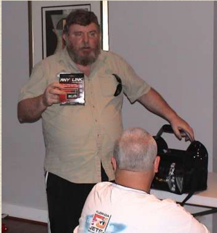
“Show and Tell” at the last RD-RC Monthly Meeting