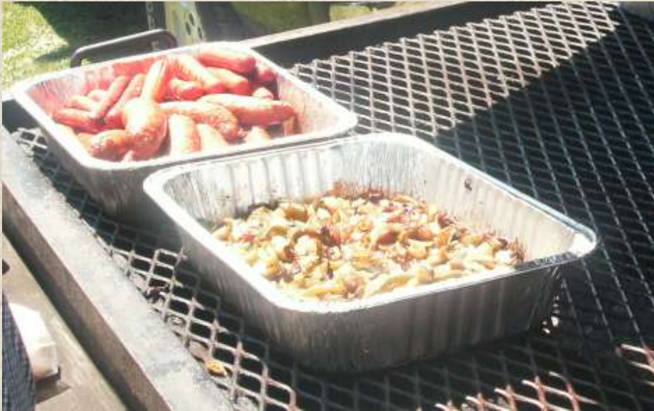
RD-RC Spring Fly-In