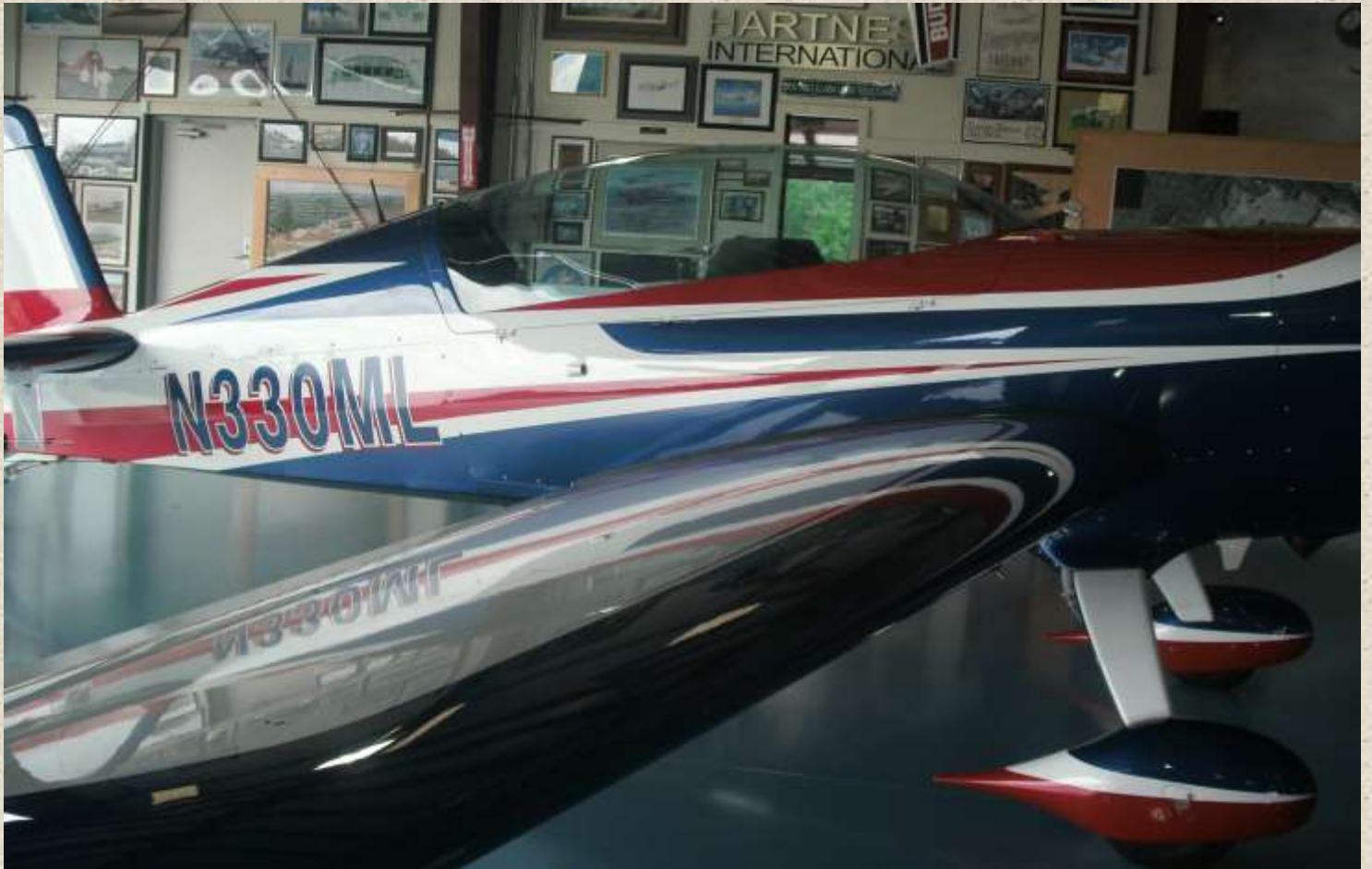
Pat's New Extra