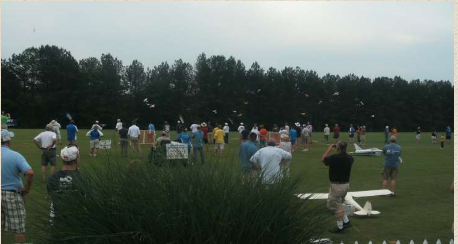
The Massive Micro Launch

Joe Nall Week, Triple Tree Aerodrome Classic Flight Line