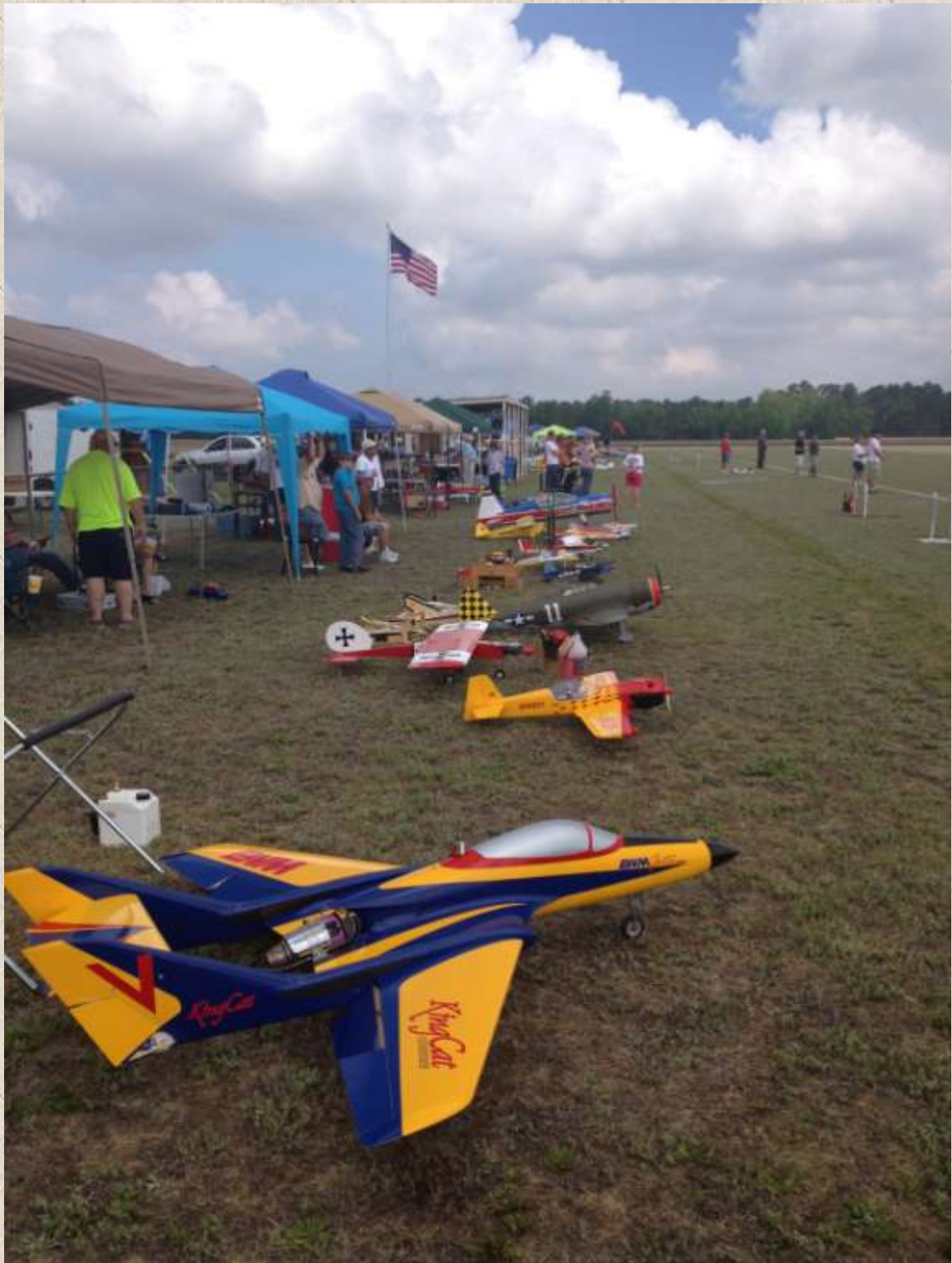
Kinston Aero Modelers (KAMS) Flyin – April 21, 2012