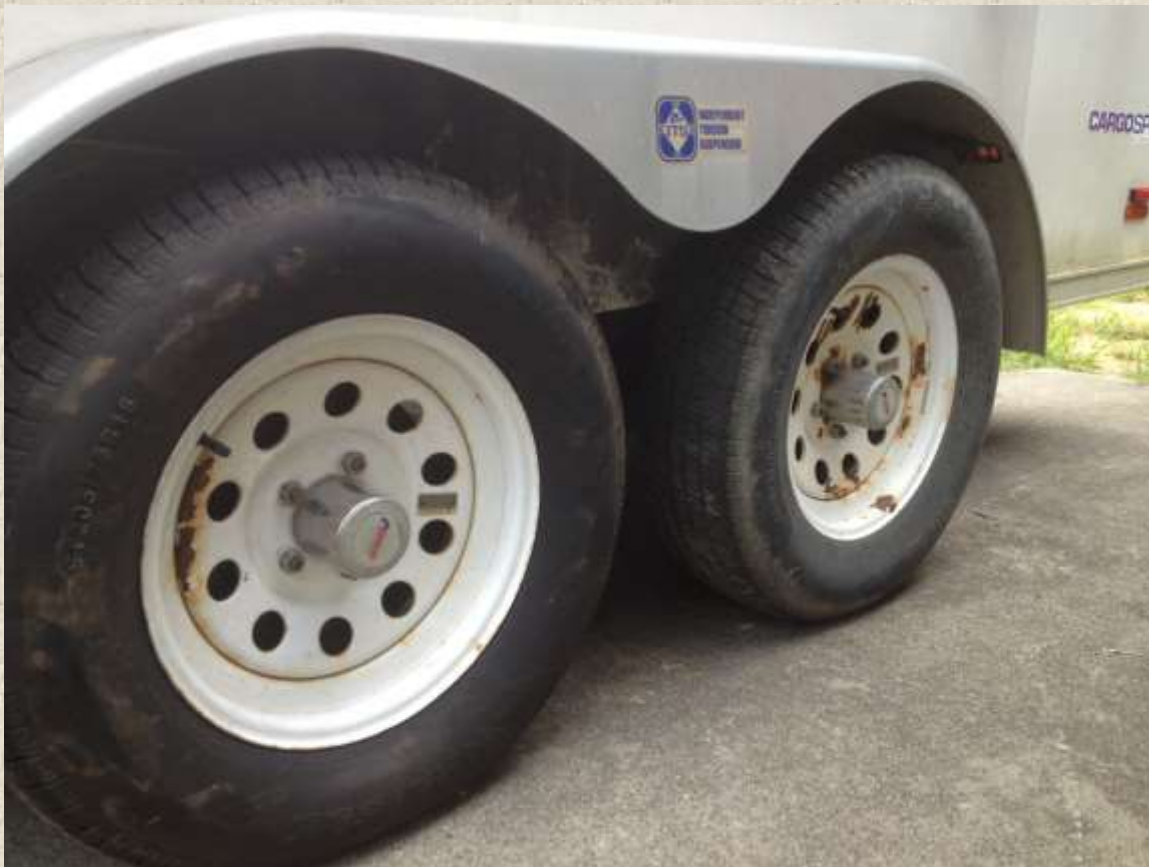
The starting point

The final segment of my favorite Power Block show showcases a variety of automotive products. One product that was showcased recently was the Dupli-Color Wheel Coating paint. With that product in my head along with the ugly reminder of how bad my RC trailer's rims look, I set off to see what could be done.