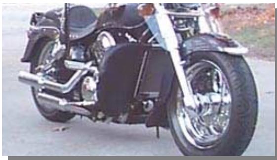
Scotworks Deluxe Engine Guard Chaps installed on a 1999 Kawasaki Vulcan 800 Classic.

Scotworks Deluxe Engine Guard Chaps for various metric motorcycle and engine guard combinations. Engine guard chaps help keep the rider warmer in winter, dryer in wet weather, and provide no noticeable negative effects from wind resistance. These chaps have been rigorously tested over many thousands of miles in all types of weather. They are designed for long life, minimum maintenance, and are a perfect match for your cruiser. These chaps are built to Scotworks standards and specifications by local craftsmen.